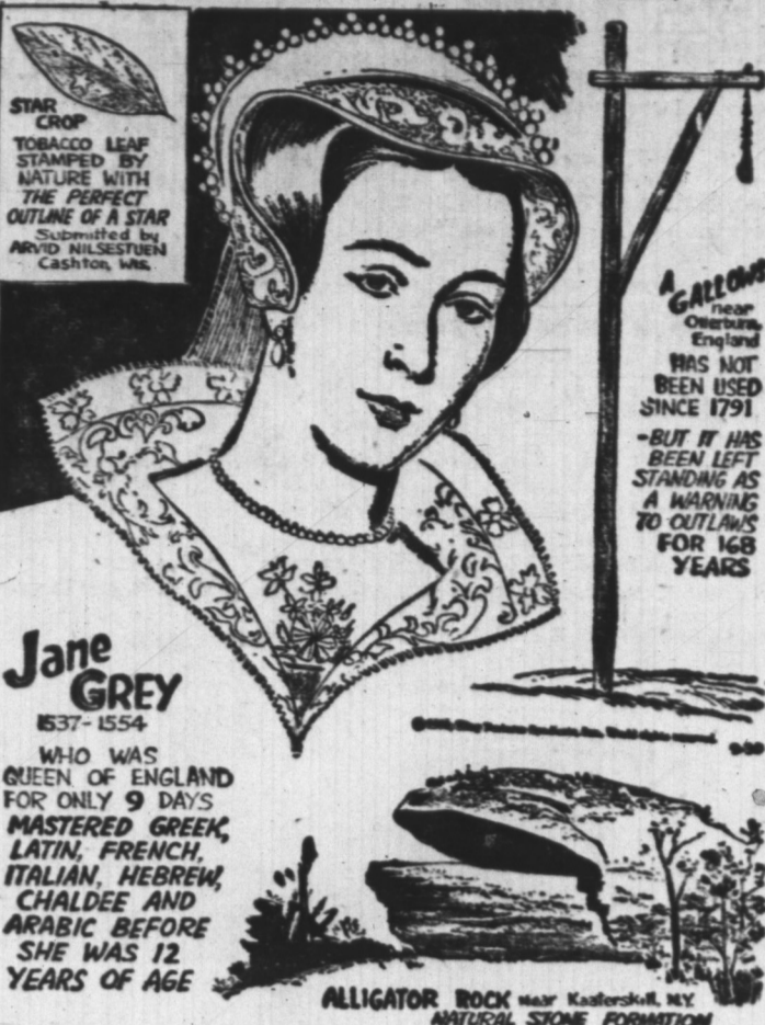
Jane Grey 1537-1554 WHO WAS QUEEN OF ENGLAND FOR ONLY 9 DAYS MASTERED GREEK, LATIN, FRENCH, ITALIAN, HEBREW, CHALDEAN AND ARABIC BEFORE SHE WAS 12 YEARS OF AGE