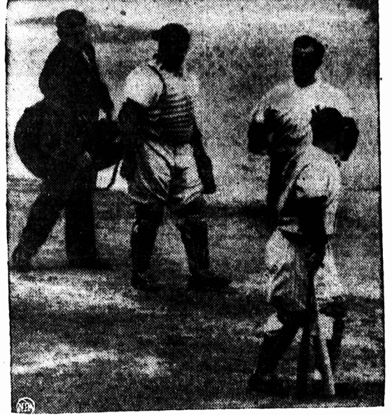
FIRST SERIES RUN—Joe Collins scores the first run for the Yankees in the first inning of the opening game of the 1953 World Series. Collins scored on Hank Bauer's triple. Berra (with bats) is the next batter. Plate umpire Bill Grieve stands behind Dodger catcher Roy Campanella.