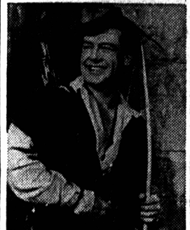
RICHARD GREENE as Robin Hood

With film star Richard Greene as the Sherwood Forest counterpart of Gene Autry, Roy Rogers and the rest of the ranch boys, the series is a canny mixture of 12th century derring do and 20th century TV know-how.