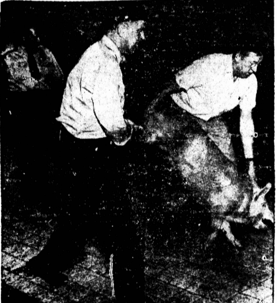
END OF A HAMMY PERFORMANCE — When 35 hogs broke loose at a slaughter house in Philadelphia, it took 10 policemen and a host of packing-plant workers an hour to round them up. Here, the last of the renegade porkers is hauled back to the pens as a cop in background mops his weary brow.