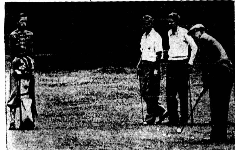
Taking his first vacation since assuming his duties as supreme commander of all allied powers in Europe, General Dwight D. Eisenhower spent nine days fishing, golfing and just relaxing in Germany, in which time he managed to mix business with pleasure, left; an unidentified Eisenhower, such as inspecting U. S. troops in the Rhine area. Above, the General is seen just after he made a chip shot to the green at Garmisch. With him are his caddy, and General Lauris Norstad, commander of allied air forces in Europe.