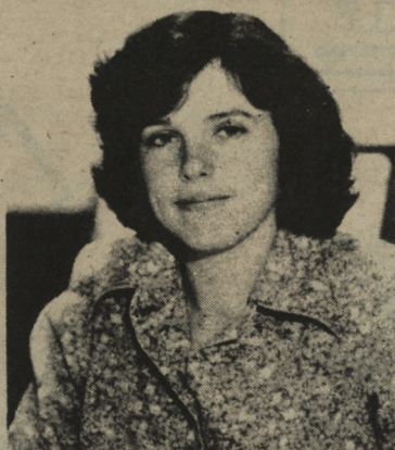
by Rita Pendergast

My office hours are: Tuesday: 9:00 - 12:00 1:00 - 4:00 Thursday 9:00 - 12:00