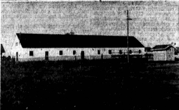
Top, Alberton Harbour; top centre, lobster traps piled on Alberton wharf; lower centre, Matthews Turkey Farm; bottom, Main Building of Alberton Exhibition.