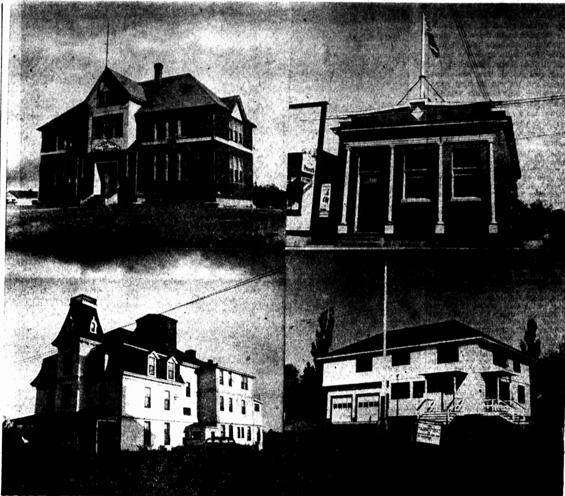
Top left—Alberton High School; top right—Alberton Post Office; lower left — Western Hospital; lower right — R. C. M. P. Headquarters, Alberton.