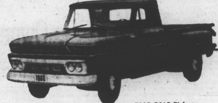
GMC C910 Pickup with Stepside body

there's a lot more to a '66 GMC pickup than meets the eye