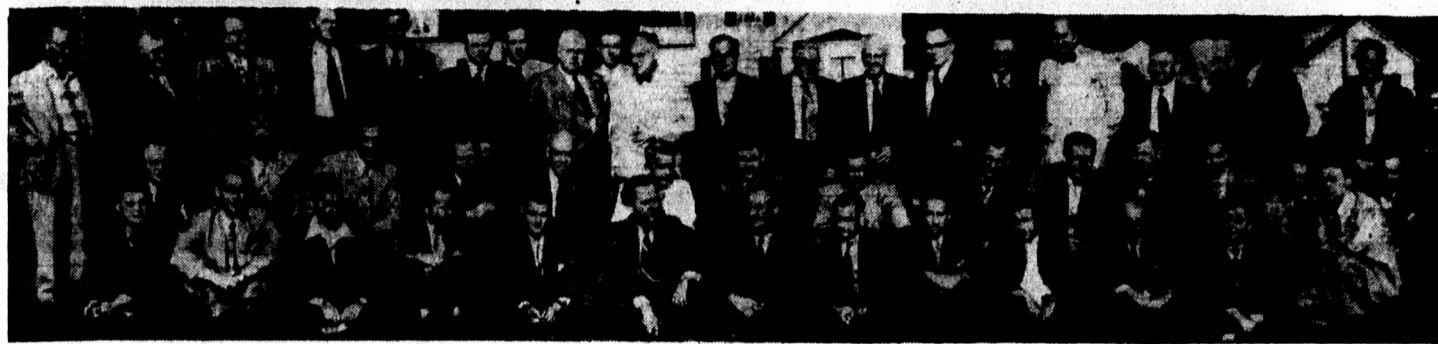
Pictured above are delegates to the annual meeting of the P.E.I. Medical Association. They were photographed outside the Provincial Sanatorium during a brief period of relaxation between clinical sessions.