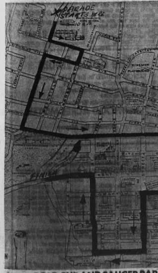
GOLD CUP AND SAUCER PARADE ROUTE Above is the outline of the route that will be followed by the Gold Cup and Saucer Parade Friday morning. The parade, to begin at 10 a.m., will form up at Queen Charlotte street below, follow along the waterfront, then turn right onto the Gold Cup and Saucer Parade Friday morning. The parade, to begin at 10 a.m., will form up at Queen Charlotte street below, follow along the waterfront, then turn right onto the Gold Cup and Saucer Parade Friday morning. The parade, to begin at 10 a.m., will form up at Queen Charlotte street below, follow along the waterfront, then turn right onto the Gold Cup and Saucer Parade Friday morning.