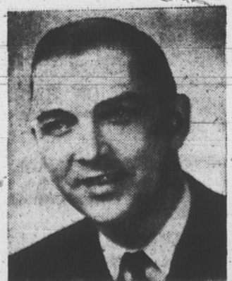
Alex Campbell Liberal Leader

Come Meet Alex Campbell and his 31 Liberal Candidates... FRIDAY, MAY 27th. - 8:30 P.M. COLISEUM - CHARLOTTETOWN