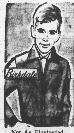
Not As Illustrated