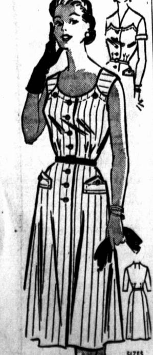
4504 by Anne Adams

FIGURE-COMPLIMENTS This PRINTED PATTERN is fashioned for the larger figure—lovely, slimming lines. It's your favorite step-in, so becoming, you will want to sew both high and low necklines, all 3 sleeve versions—for year 'round wear! Printed Pattern 4504: Women's Sizes 36, 38, 40, 42, 44, 46, 48, 50. Size 36 takes 4 1/2 yards 35-inch. Printed directions on each pattern part. Easier, faster, accurate. Send FORTY CENTS (40 cents) in coins (stamps cannot be accepted) for this pattern. Please print plainly SIZE, NAME, ADDRESS, STYLE NUMBER. Send to ANNE ADAMS, care of Charlottetown Guardian, Pattern Dept., 60 Front St., W., Toronto, Ont.