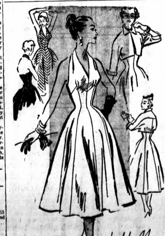
PATTERN A690 by del Mar

By ELEANOR ROSS This is the time to give slip covers and upholstered furniture a bright new look. Before removing slip covers, get after surface dirt with the upholstery attachment of your vacuum cleaner. It will make the job much easier. Then turn the covers inside out and plunge them into a bath of soda. To SPEED DRYING Slip covers should be washed, according to weave or fabric, the same as drapery fabrics. An electric fan placed nearby will help to speed up the drying process. Iron won't be necessary if you put them back on the furniture while still slightly damp. Chair backs and seats become especially dirty during the winter. Steam heat and closed rooms give furniture little chance to air out and cause the dirt to settle. Then, too, the family is home more during the cold weather months and furniture really gets plenty of use. SUNNY DAY JOB Plan to clean upholstery on a sunny day. First go over all pieces with your vacuum cleaner. Then, if possible, carry small pieces, such as dining room chairs, outside to be revived. Large pieces, such as sofas and wing-backed chairs should be placed near an open window if possible. Use a soft brush or sponge to apply "dry" suds to the upholstery. We might remind you at this point that "dry" suds are made