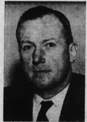
HON. ANDREW B. McRAE Minister of Agriculture