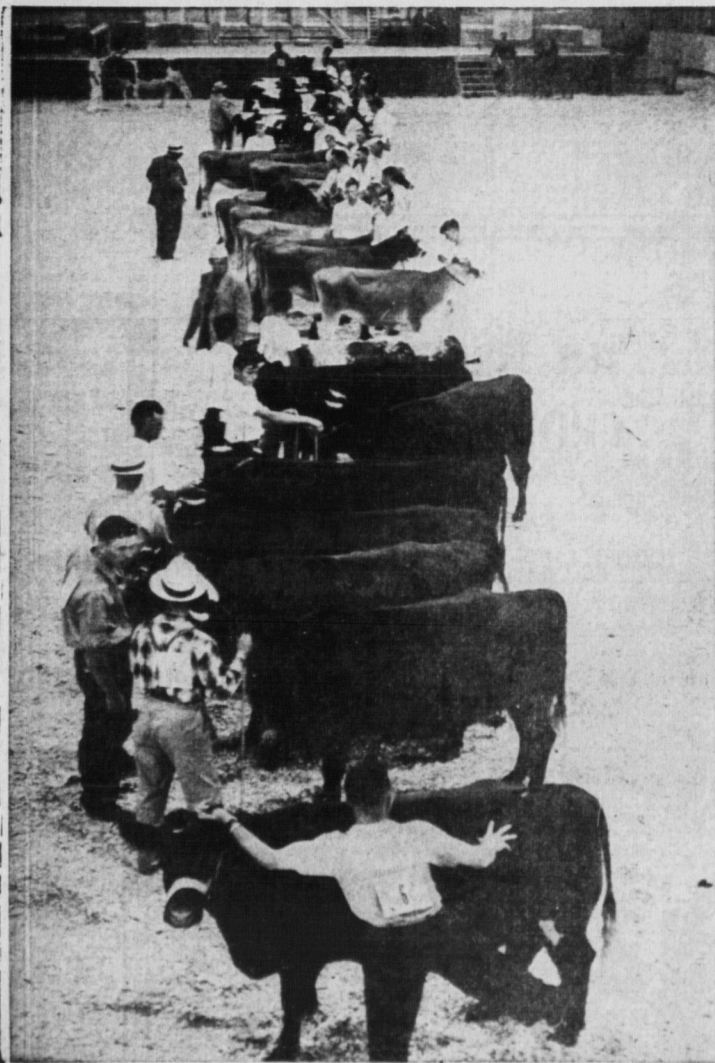
IMPRESSIVE LINEUP GIVES JUDGES DIFFICULT TIME