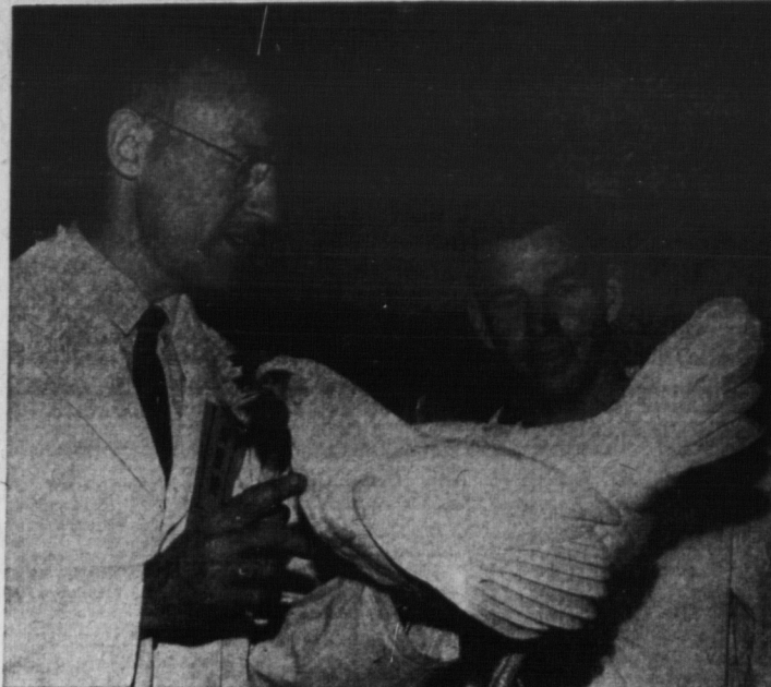
POULTRY JUDGING ALWAYS FINDS WELL-FILLED CLASSES