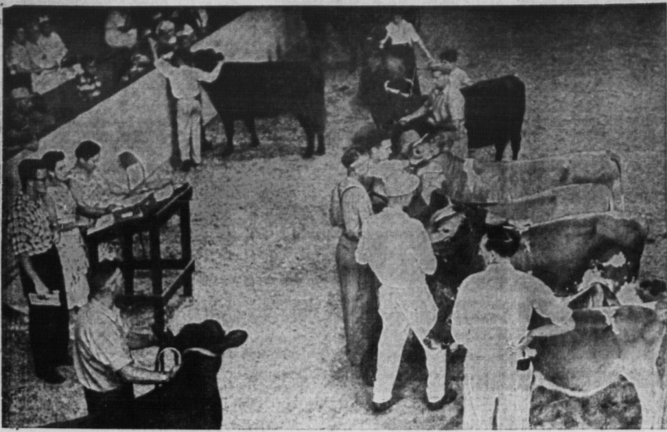
EXCITEMENT PREVAILS THROUGH COLISEUM AS NAMES OF WINNERS ARE ANNOUNCED

15-A Mon., April 30, 1962, The Guardian - The Patriot