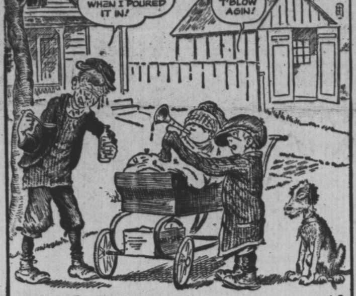
THE BLOWOUT JR. WILLIAMS 4-9