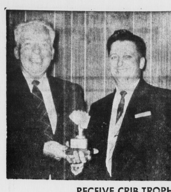
RECEIVE CRIB TROPHY Members of ten teams who participated in the O'Leary Legion Cribbage Tournament, Tuesday night were guests of a dinner at the Legion Hall.

Your wedding reception is your very first social event of your married life — the Charlottetown Hotel will help you make it a brilliant success. Experts take over all the work and worry leaving the bride her radiant and happy self on the most important day of her life. No need to wait for weddings to sample the Charlottetown Hotel service. It is perfect for engagement parties and showers too. For a wedding to remember ring us at 4-7371.