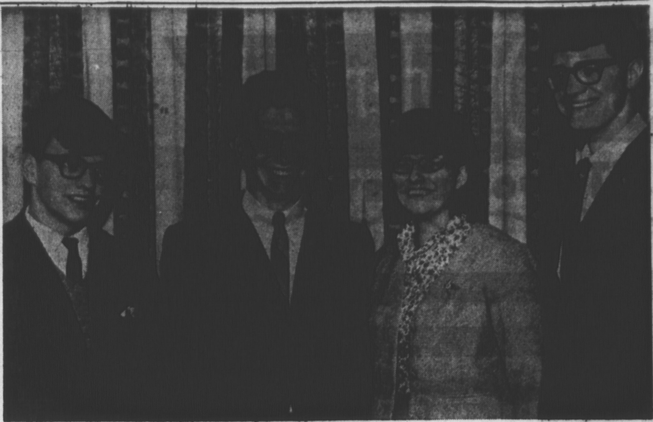
HERE ARE THE members of the executive of Prince of Wales College United Nations Society which plans an educational and cultural tour of New York City during the