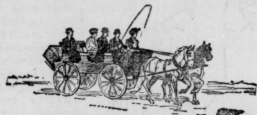
NEW PATIENTS ON WAY TO HOSPITAL

No effort is being spared to meet every call. . . . Not a single applicant has ever been refused admission to the Free Hospital because of his or her poverty,