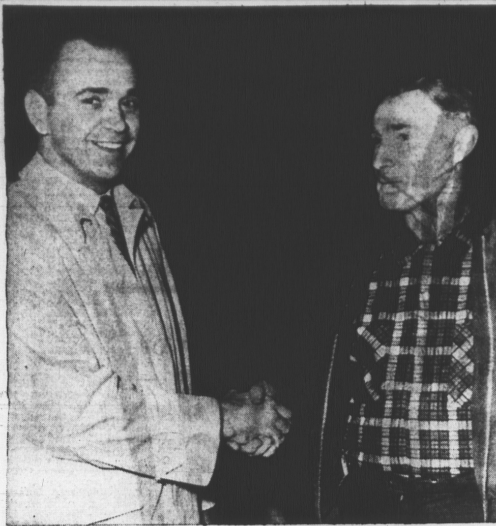
OWNER AND BUYER OF STEER