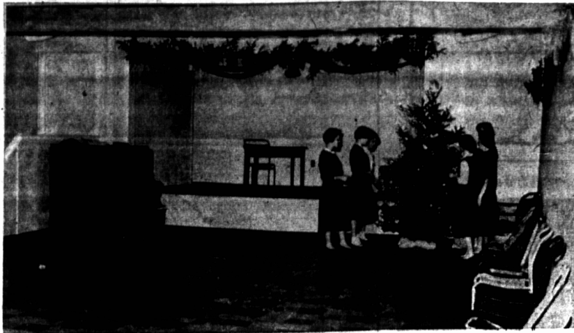
THE DECORATING of the Christmas tree by the girls shown in the photo above is a history making event in that the girls are preparing for the first Christmas concert to be staged in the new auditorium of the Southport School.

The auditorium is built in the basement of the new building and will seat 200 people. It has modern stage and kitchen facilities and will be used for extra-curricular activities and for gatherings by the community.