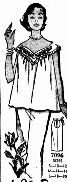
7096 SIZES 5-10-12 M-14-16 L-18-20 by Alice Brooks

People cannot be reformed by telling them that their action is right and that one wrong. The chances are that even the dangerous criminal knows right and wrong about as well as the average citizen. When character is lacking, education increases the ability of the person to make trouble. The whole structure of human society rests on character. —(William Feather).