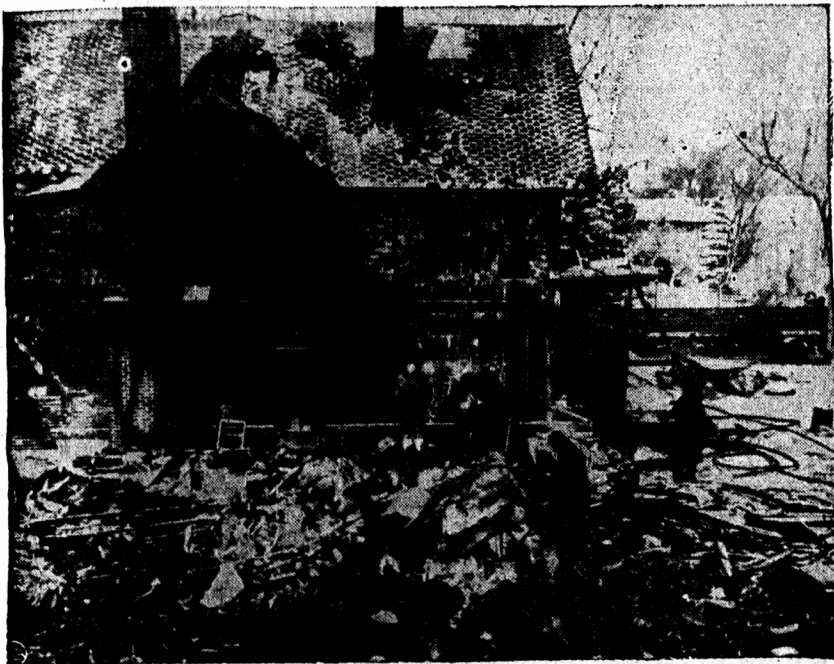
GRIM SEARCH — Rescue workers search through the wreckage of the Minneapolis, Minn., plane crash, where 15 persons met death when a Northwest Airlines passenger plane smashed into a home. In the foreground is the debris which remains of the plane and the house. Still standing is the adjacent house, which caught fire.