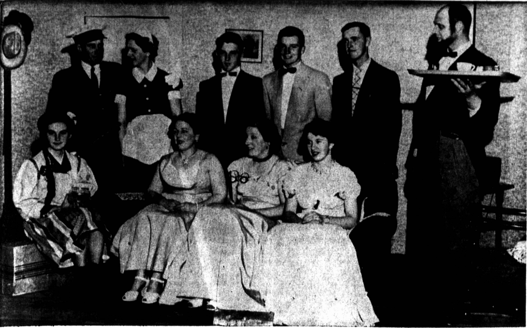
WHEATLEY RIVER PLAYERS

"Here Comes Charlie" is the name of the play the cast of which is seen in the above pic-