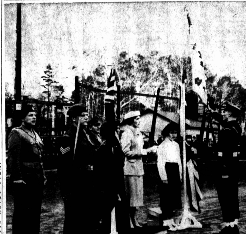
QCHS CADET CORPS RECEIVES STANDARD