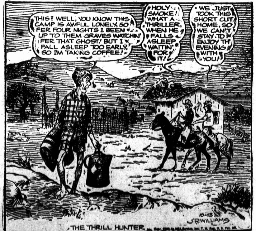
THE THRILL HUNTER