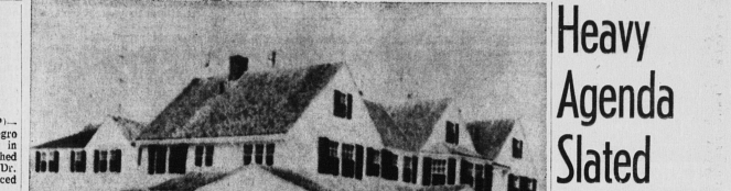
OTTAWA (CP)—Prime Minister Pearson leaves this morning for an intensive familiarization session with President Kennedy that will span the globe while bearing hardest on multiple Canada-United States problems. Mr. Pearson was leaving at 10:55 a.m. by RCMP Comet jet for the president's summer home at Hyannis Port, Mass. There the two men will hold a working session today starting at 1:30 p.m. and nine tomorrow. They will dine together three times before the prime minister leaves about 3 p.m. Saturday for Ottawa. The Canadian leader was accompanied by a small but high-powered staff group. Mr. Pearson, putting the prime ministerial real estate to rights, stayed home. Mr. Kennedy's first trip abroad after his election in 1960 was to Ottawa. Mr. Pearson, in office less than three weeks, picked quick visits to London and Washington during the campaign for the April 8 election and he was in Britain last week.