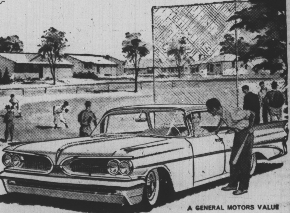
The perfect balance of luxury and economy... Catalina 2-door Hardtop.