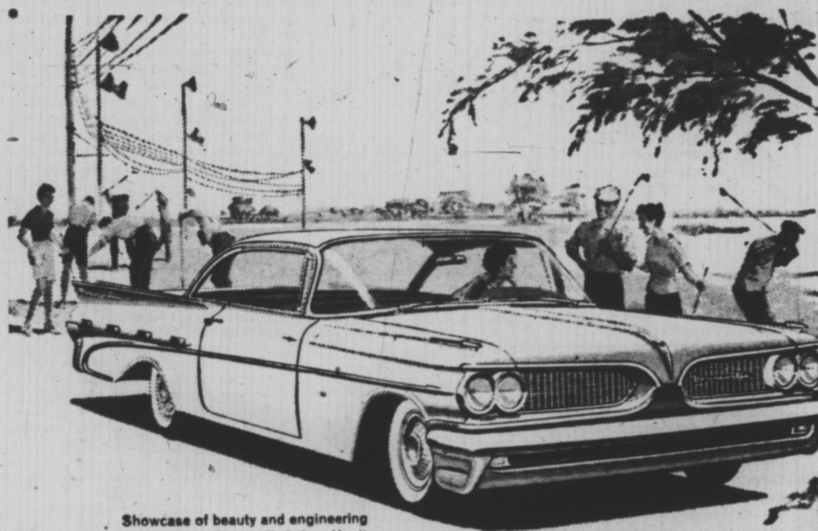
Showcase of beauty and engineering perfection... Bonneville 2-door Hardtop.