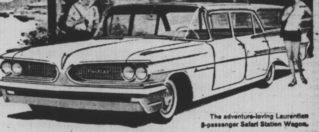
The adventure-loving Laurentian 8-passenger Safari Station Wagon.

Don't waste a moment... see your PONTIAC dealer today!