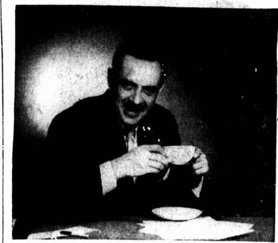
BUSY MAN ENJOYS TEA BREAK—Here's a man who has found a cup of Tea works wonders when the pressure mounts.