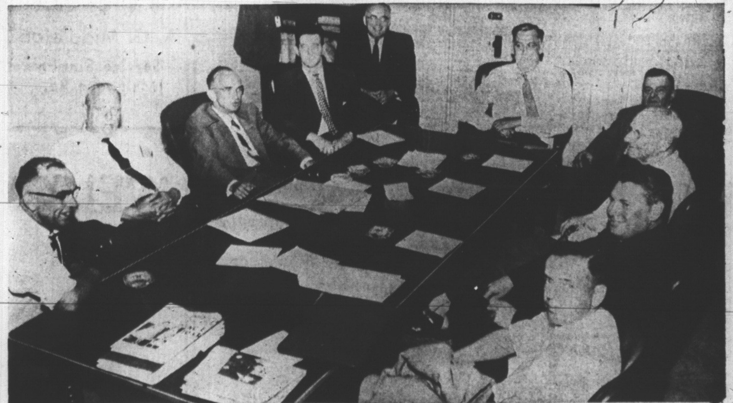
THE TOP ROLE in perfecting Island plans for this week's Royal visit has been played by members of this group, the Provincial Advisory Committee which has been functioning since early this year.