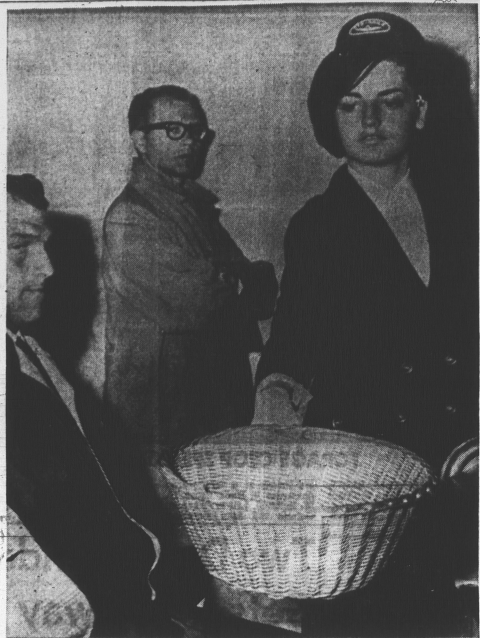
In the new parish of Ste. Odile in Quebec City, duties normally carried out by men have been taken over by 17 attractive girl students. The girls, wearing special uniforms and christened hostesses in the house of God, serve as ushers, collect the offering and check for lost articles after services.

The dearth of male students in the field is another concern, she says, although of late there has been an increase in the number of men taking such courses.