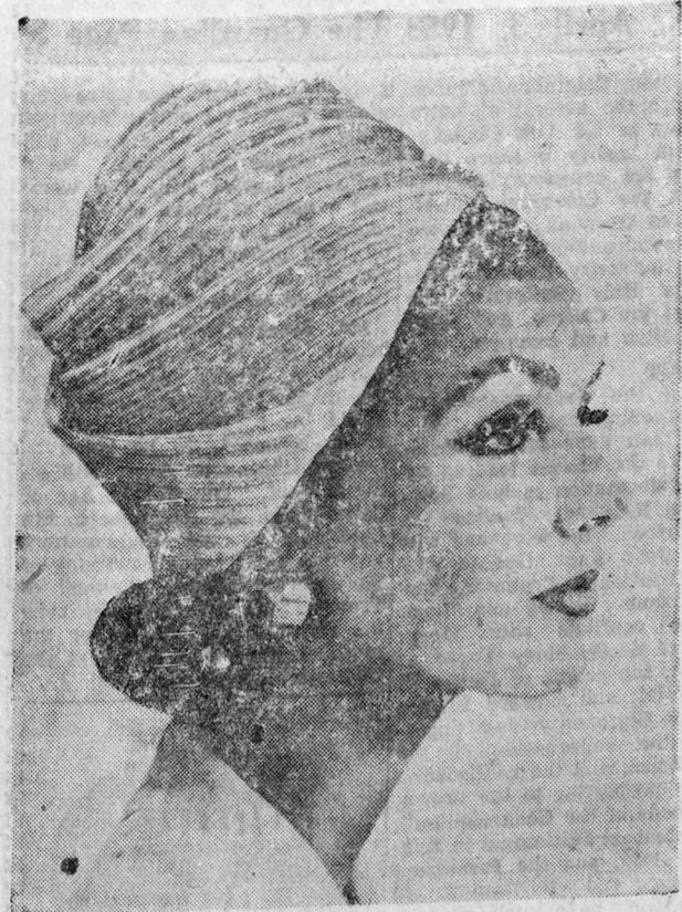
UPSWEEP HAT LINE

The upswep turban complements the chemise as well as other costume lines so well that it emerges as a major millinery trend. From Leslie James of California comes an interesting example of the upswep turban, this one of white silk organdie, striped with lemon yellow Milan straw. The swirling tiered effect of the crown is decorative and different.