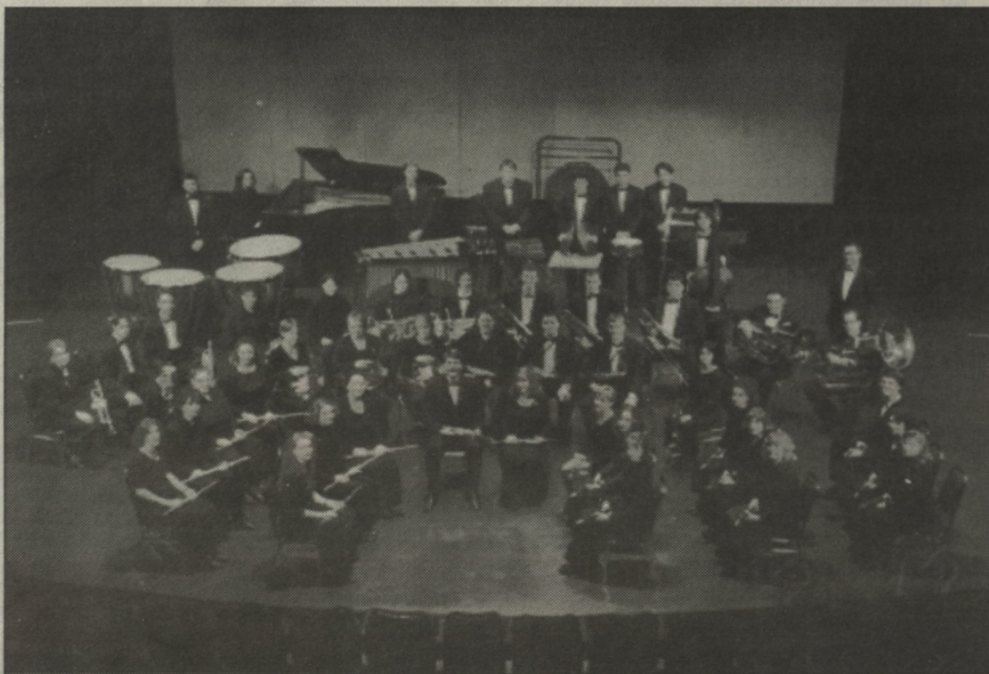
UPEI's Wind Symphony

This concert will truly prove to be a worthwhile experience and we look forward to seeing you there!