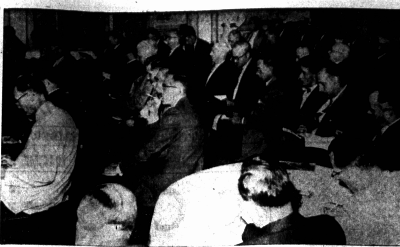
ADVERTISERS TAKE KEEN INTEREST IN ADVERTISING CLINIC