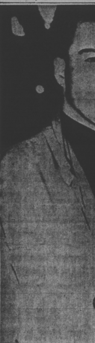
HE CAN GO OUTSIDE AGAIN