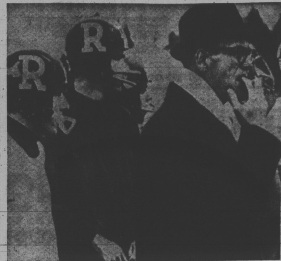
NAIL CHEWING TIME