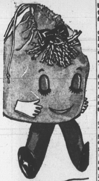
by Alice Brooks

FOR TOTS TO TEENS Surprise tots to teens with a handy, Tidy Bag. Felt for features, hands, shoes. New! Miss Tidy-Up holds curlers, headbands, nylons, a nifty thing! Make of gay cotton. Pattern 7052; pattern pieces, bag 9 1/2 inches high. THIRTY-FIVE CENTS (coins) for each pattern (no stamps, please) to Alice Brooks, care of Guardian Patriot Needlecraft Dept., 60 Front St. W. Toronto 1, Ont. Ontario residents add one cent sales tax. Print plainly pattern number, name, address. GIANT 1966 Needlecraft Catalog stars knit, crochet—many more needlecraft designs. 3 free patterns printed in catalog. Send 25 cents. NEW! 12 Collectors' Quilt patterns for you in color, with quilting motifs. Finest pattern ever collected from famous seamstresses. Send 60 cents for new Museum Quilt Book No. 1—sixteen complete patterns. 60c.