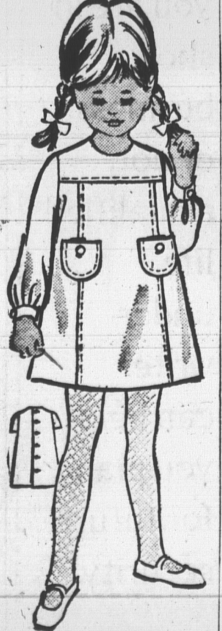
by Anne Adams

stuffing (often omitted) 1/4 tsp. flour 1/4 tsp. salt 1/4 tsp. pepper 1/4 tsp. ground anise (optional) 1/4 c. melted margarine 1/2 tsp. fine-grated lemon rind 1/2 c. hot water 2 tsp. tomato paste 1 tsp. beef broth powder 1/4 c. sour cream Cut veal steak into 2" squares. Pound with meat mallet or edge of a heavy sauce until steak squares are about twice as large as you cut them. Mix egg yolk into stuffing and put 4 tbsp. on each piece of veal. Roll up fasten rolls with wooden picks. Dust each "bird" with mixture of flour, salt, pepper and anise. Brown in margarine; then gradually stir in lemon rind, hot water, tomato paste and beef broth powder. Bring to rapid boil; then transfer to casserole. Bake 1 1/2 hr. in mod. oven, 325 to 350 degrees F. or until "birds" are fork-tender. Remove from casserole; take out picks; return "birds" to