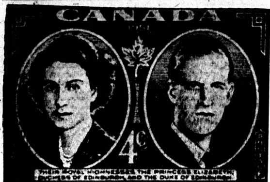
STAMP OF ROYALTY—Canada has issued this four-cent postage stamp commemorating the visit of Princess Elizabeth of Great Britain and her husband, the Duke of Edinburgh.