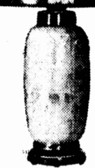
This beautiful "Aladdin" Lamp with Mother of Pearl base, triple cord with Chinese Red, Purple, Green or Black with matching White-Glass shade. Only $8.95.