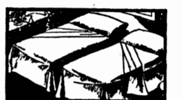
Or you may have twin beds each with an inner-spring mattress. A good idea for a boy's or girl's room.