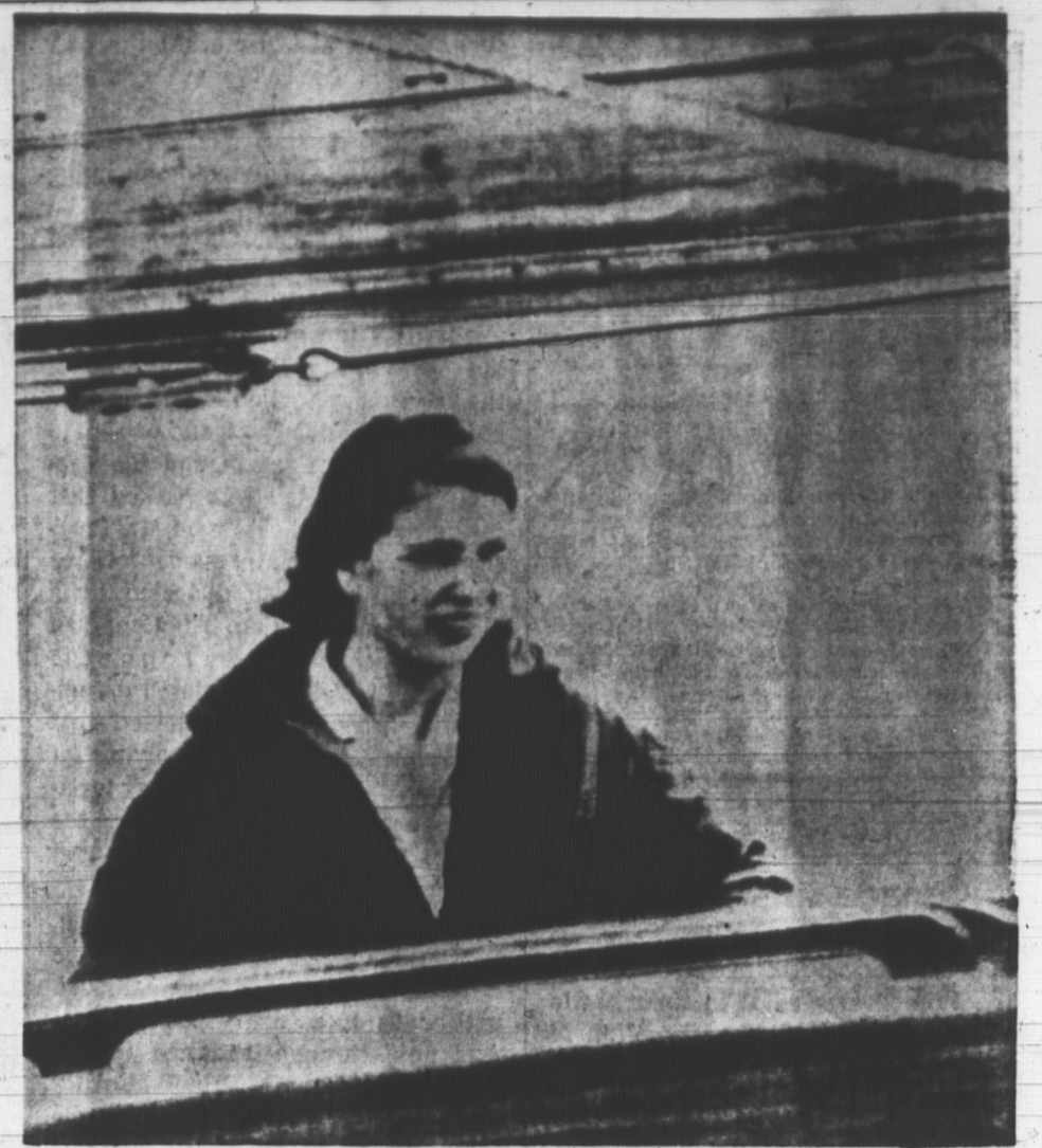
PRINCESS SAILING ALONG