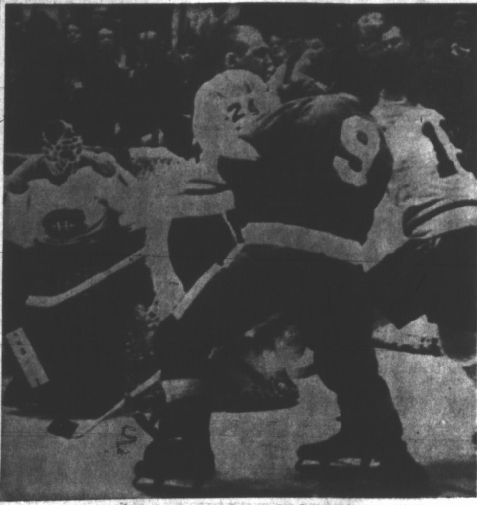
GORDIE HOWE STOPPED