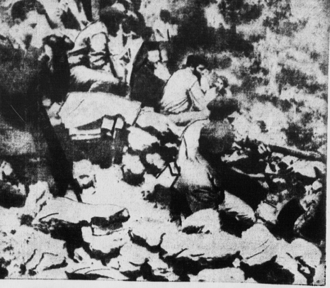
FRONT LINE VIEW FOR CYPRUS PRESIDENT Cyprus President Archbishop Makarios sits among front-line Greek Cypriot fighters at a gun emplacement looking down on Turkish-held Kyrenia Pass on Cyprus Monday. Makarios visited National Guard units in the area of Saint Miltos Castle. Meanwhile scattered firing was reported in the area.

East Pictou Rural High School, R. R. No. 1 Thorburn, Pictou County, N.S.