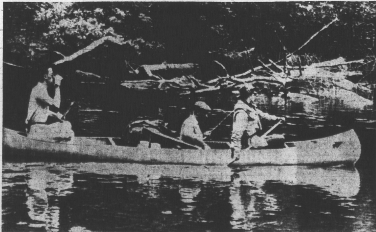
LYNDA HAS TO PADDLE

Thus, after subscribing the initial $250 the tenant would pay $166 a year for 10 years. But here, another aspect of the investor plan comes into play. Campeau in effect pays a return of 12 per cent a year to the tenant on the total equity, or $180. The difference between the two—$14 a year—is actually paid over to the tenant.