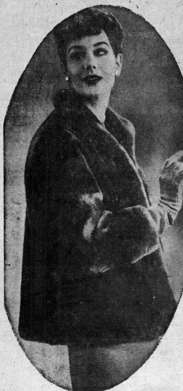
Many Additional Coats and Jackets Not Listed.