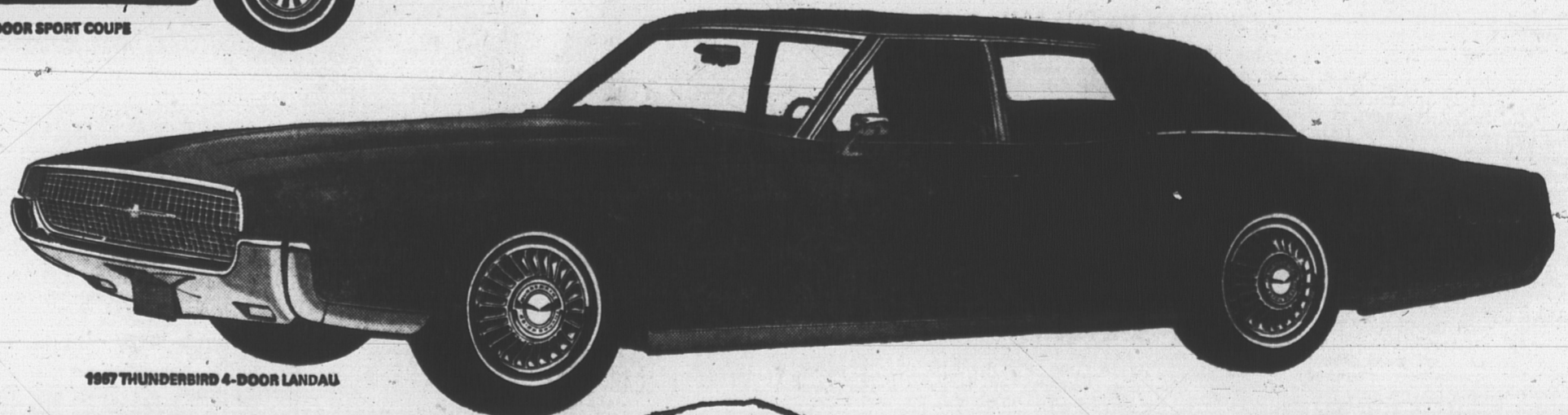
1967 THUNDERBIRD 4-DOOR LANDAU

More than ever, unique in all the world... redefined... reshaped to the ultimate of automotive elegance.