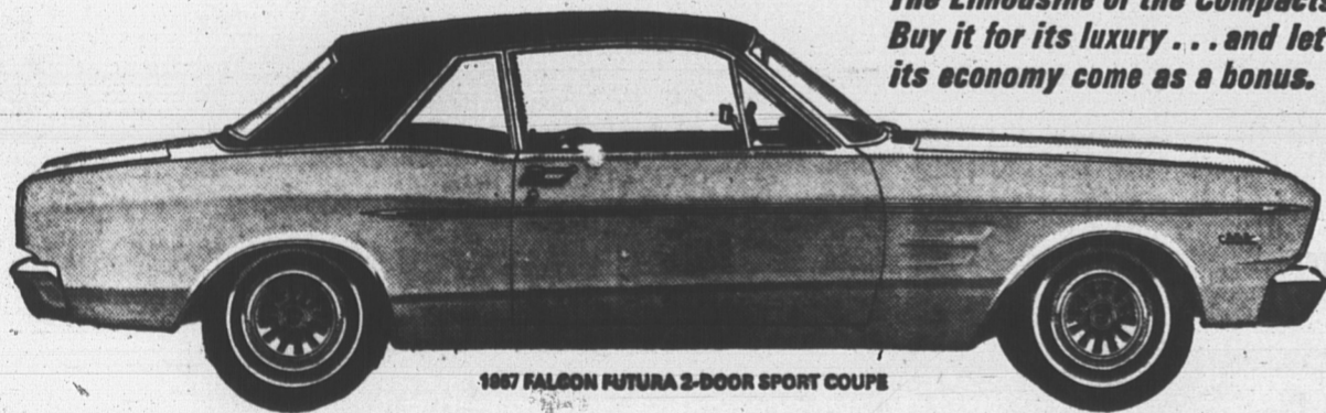
1967 FALCON FUTURA 2-DOOR SPORT COUPE