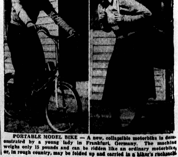
PORTABLE MODEL BIKE — A new, collapsible motorbike is demonstrated by a young lady in Frankfurt, Germany. The machine weighs only 15 pounds and can be ridden like an ordinary motorbike, or, in rough country, may be folded up and carried in a hiker's rucksack.

The surface area of the earth is estimated to be 196,826,000 square miles, of which 141,050,000 square miles are water.