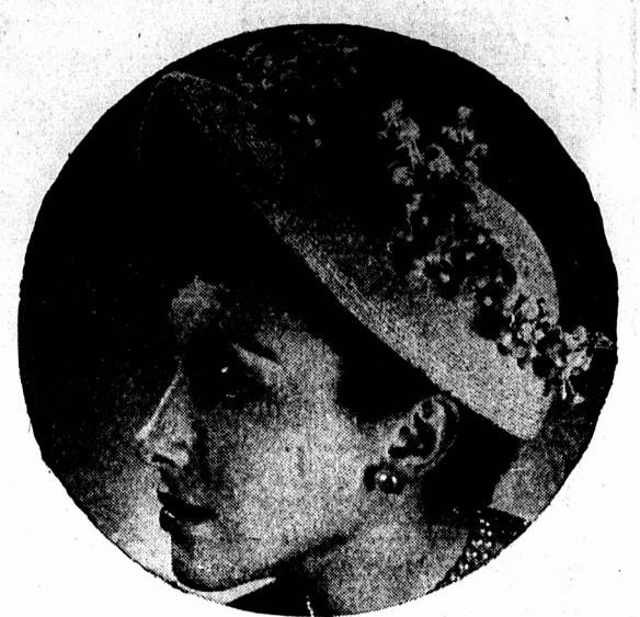
Very "spring" — this young bonnet of blonde milan-type straw with forward-moving brim and encircling garland of mimosa. By Elfreda.

The feeling of lightness suggests into the hat materials; straws are thin and pliable as chiffon and many are transparent, chiffon itself is basket woven or draped into the new rocker clothes and rocker turbans. There is a new celophane straw, luminous and iridescent like the inside of a seashell. There are many horsehair straws and braids.