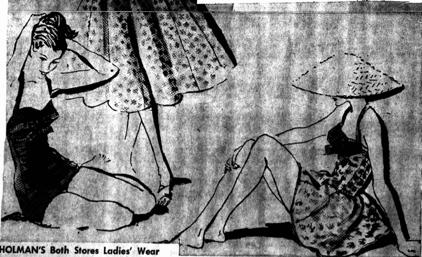
HOLMAN'S Both Stores Ladies' Wear

Sundresses 16.98 to 19.98 Swim Suits 9.98 to 16.95