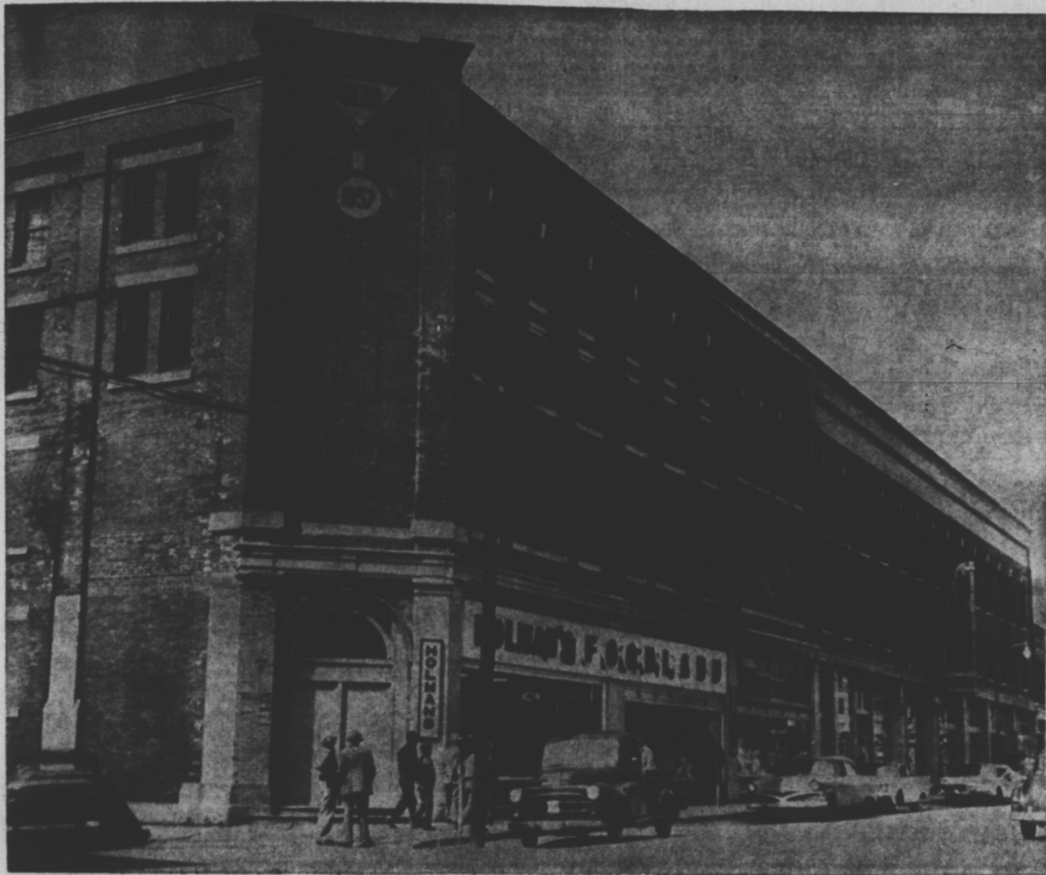
Pictured above is Holman's Summerside store. It occupies almost a whole business block. Together with its sister store in Charlottetown (pictured below) it is the biggest retail business on Prince Edward Island.