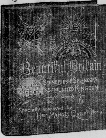
Large quarto volume (11 1/2 x 13 1/2 ins.), 386 pages. Extra enameled paper. Extra English cloth, emblematic embossing in ink and gold.

Views of Stately Houses, Photographs Taken by Permission of Her Majesty, The Queen, and By favor of the Noblemen and Gentlemen who Own these Historic Places