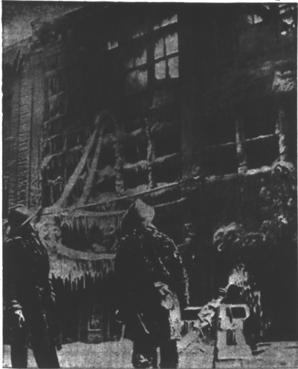
FIRE FIGHTING EFFORTS LEAVE ICE COVERING

Free Democrats would be serious, but not necessarily fatal. Under the West German constitution he could go on ruling with a minority government until the election. The chancellor, caught between domestic politics and world opinion, has avoided getting too closely identified with one side or the other in the Nazi murderers dispute. He said last summer he would consider it monstrous if any Nazi murderers got off free. But in November he and his cabinet decided