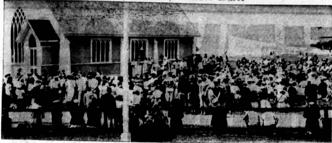
PART OF THE crowd attending a.m. on Sunday Morning are seen day observance at the Indian reservation at Lennox Island. An outdoor solemn mass at 11.00 above at the annual St. Anne's servation at Lennox Island.