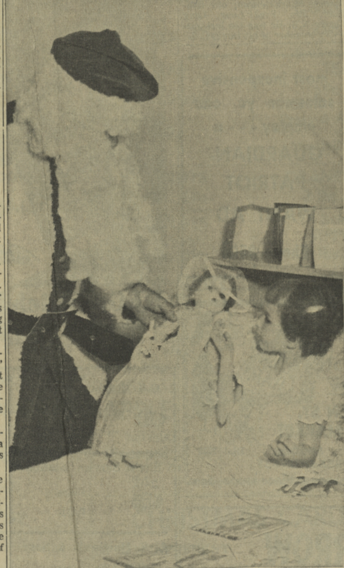
CHRISTMAS IN NOVEMBER

Gruening, 71, of Juneau was maintaining an edge of about 500 votes over Mike Stevovich, his Republican opponent. Stevovich, 39, a lawyer from Fairbanks, resigned as appointed governor of Alaska in August to seek the Senate seat.