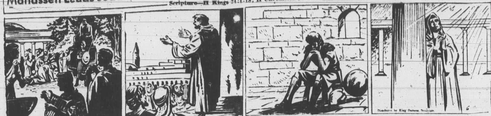
Manasseh destroyed Hezekiah's reforms and covenants, restored idolatry in its most evil forms, and led the people away from God. — II Kings 21:1-9; II Chronicles 33:1-2. Prophets warned of God's impending judgment of captivity, death and destruction, but Manasseh scorned them and continued his evil ways. — II Kings 21:10-15; II Chronicles 33:10. Captured and carried away in chains by the Assyrians, Manasseh listened to the prophets in prison, repented and prayed for deliverance. — II Kings 21:16; II Chronicles 33:11-13. God returned Manasseh to Jerusalem where he tried to atone for his years of evil. — II Kings 21:17-18; II Chronicles 33:14-20.

MEMORY VERSE: "Therefore, to him, that knoweth to do good, and doeth it not, to him it is sin." — James 4:17.