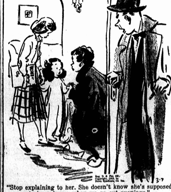
"Stop explaining to her. She doesn't know she's supposed to be unhappy when we go out evenings."

Application forms are now available to students interested in the International Students Seminar to be held in India this summer. Preference will be given to students with three years university and who are returning to the campus next year. As this is far from being a pleasure trip or tourist cruise, the matter of choice is a very important one. Due to the changes in diet and climate, first of all the applicant has to be of strong physical constitution. When there he will have to attend two lectures daily, take part in discussions and contribute all he can both to the Canadian and to the Asian delegates. After the Seminar proper which will centre around the theme "The Human Implications of Development Planning", the group will separate into six smaller bodies whose duty it will be to travel to universities and communities in allocated parts of India and the neighboring states, and there mingle with as many as possible giving them an idea of Canadian and Western life. This is an important part of the Seminar, as students of Communist countries are doing this very thing to win the Indians to their favor, and it is the hope of the Directors to check somewhat their influence. On his return to the campus, the delegate has the obligation of imparting to the students of the community and to the people of the Province at large, the ideas he has accumulated and the experiences he has had.